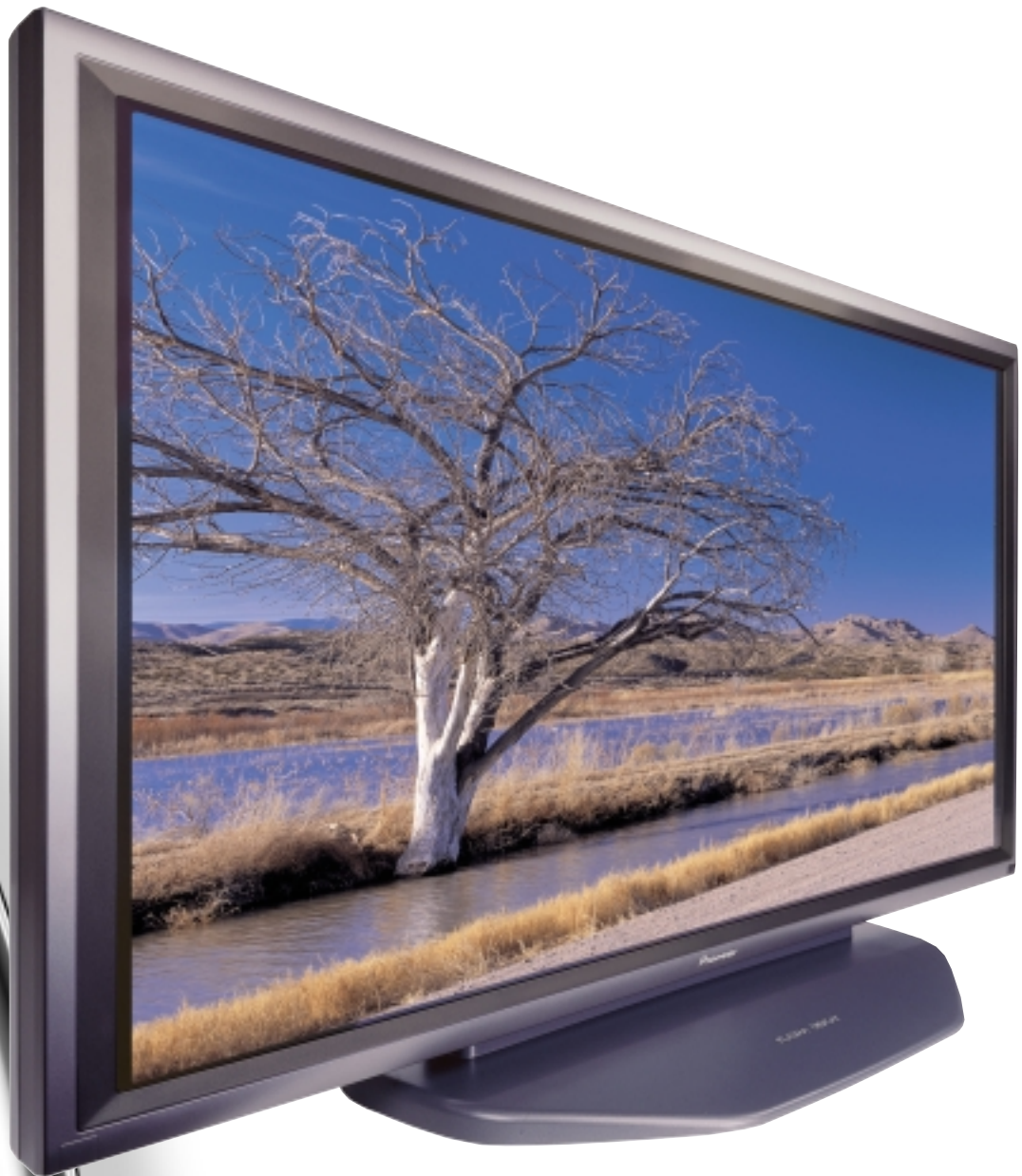
Pictured With Optional Table Top Stand (PDK5001)

Clean, sharp, high resolution image reproduction for video or computer generated data and graphics